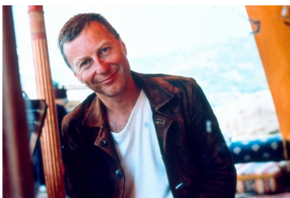
Director Milcho Manchevski

Today is the 5th day of the 68th Venice International Film Festival. To commemorate one of the world's oldest and most respected festivals, I present you with an in-depth interview with one of the prestigious Golden Lion winners for Best Director, Milcho Manchevski, who won the award in 1994 for his epic masterpiece BEFORE THE RAIN (1994).