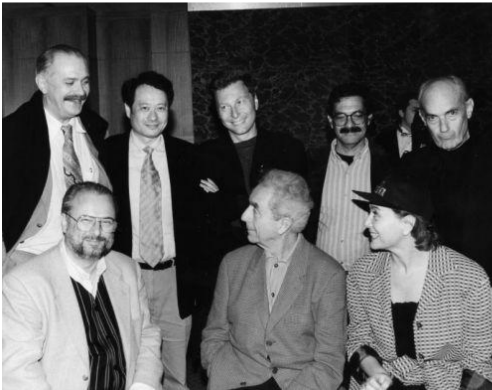
Milcho Manchevski (top middle) in 1994

Interview conducted by Vanessa McMahon, posted on September 04, 2011.